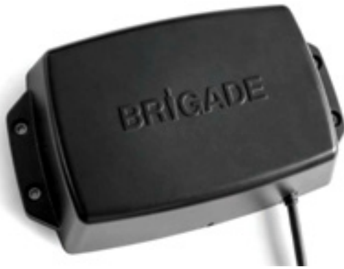
Brigade - BS8000